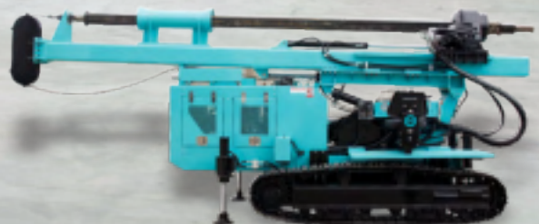
BORED PILE DRILLS EVOMAQ®