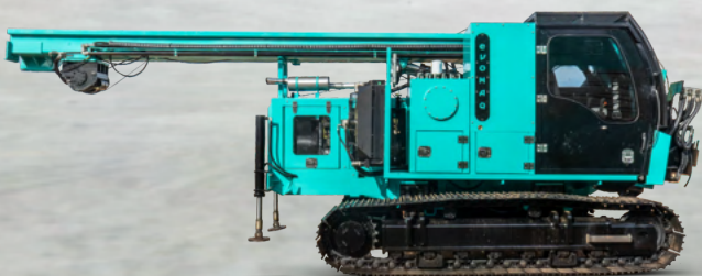
FROM SMALL TO LARGE-SIZED CONTINUOUS FLIGHT AUGER (CFA)